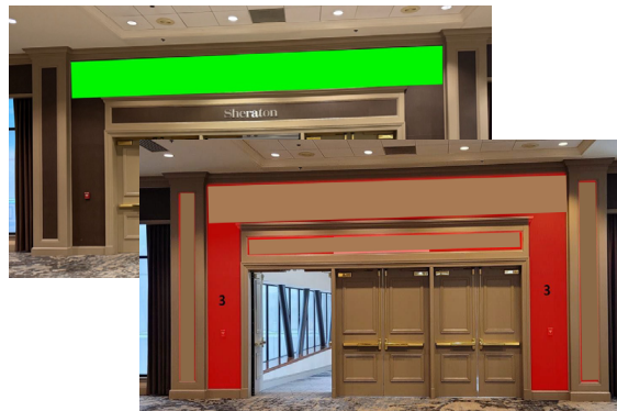
Second Floor Conference Exit Top or Side Panels